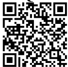
Visitor QR code

Milner Baptist Church Mailing Address: 107 Pecan Drive Milner, GA 30257 Office: (770) 358-2954 Email: milnerbaptistchurch@gmail.com Website: www.milnerbaptistchurch.com