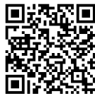
Visitor QR code

Milner Baptist Church Mailing Address: 107 Pecan Drive Milner, GA 30257 Office: (770) 358-2954 Email: milnerbaptistchurch@gmail.com Website: www.milnerbaptistchurch.com